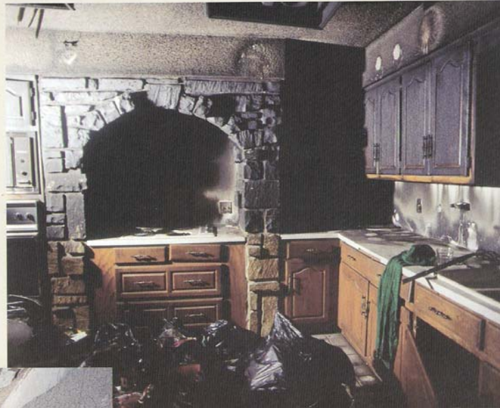
Residence fires strike often, consume quickly and can leave a family's life in tatters.